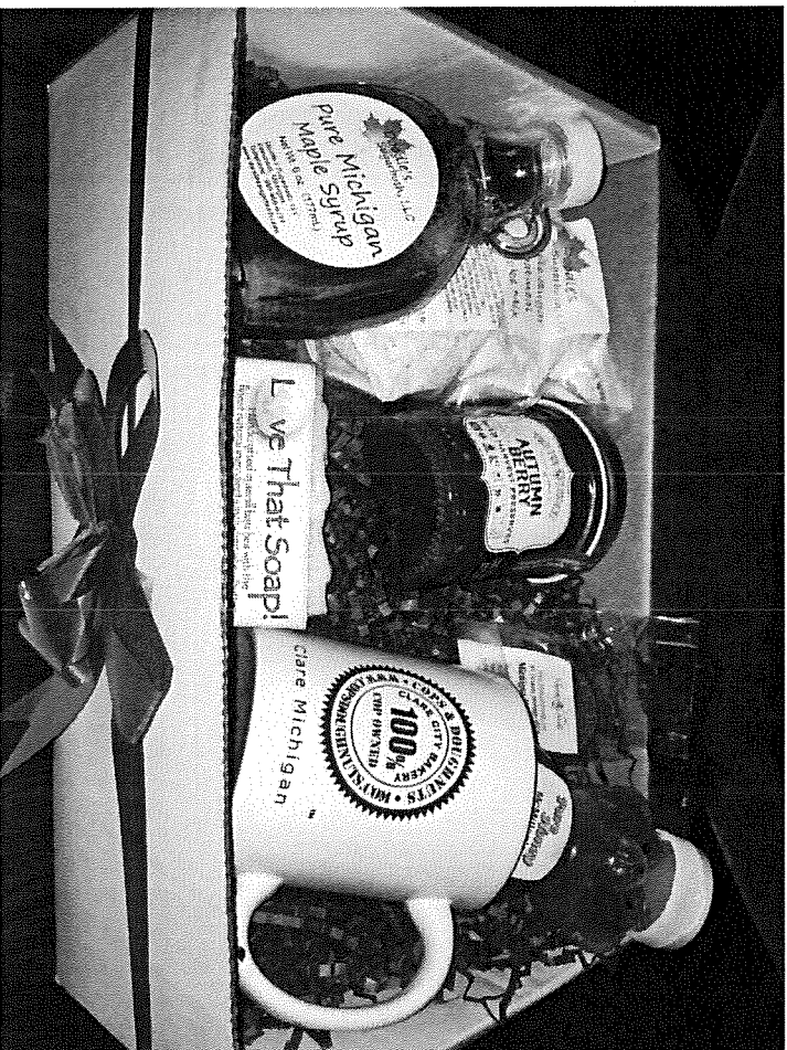
Rotary's Isabella County Gift Basket. Still available until 12/20/16

Music: Kathy Beebe led us in "12 Days of Rotary" which seemed more like 24!